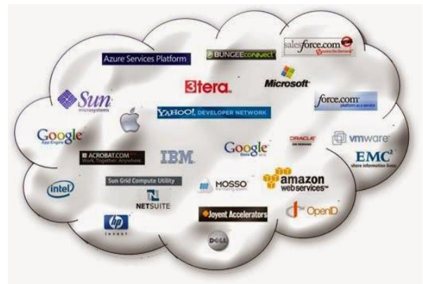
Figure 3. Major cloud services providers

• It supports application programming interfaces for the data store, image manipulation, Google accounts, and email services.